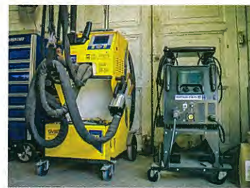
GYS Spot welder and NEOPULSE 270 MIG welder ready to go to work.