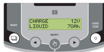
Intuitive interface available in 22 languages